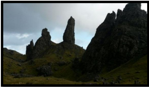
The Storr deadline is looming.

Old Man of Storr: THE Old Man of Storr consultation survey has sparked an encouraging response in Staffin. The SCT is grateful to everybody who has made their views known on this hugely important community project. After the Friday November 27 deadline for survey returns, SCT and Highland Council will analyse the results and produce a report which will be published for everybody to access, both online and hardcopies. SCT is in discussions with Highland Council regarding the purchase or lease of the land (or part of) for the community benefit of Staffin. SCT sees it is a fantastic opportunity for the community to have a direct involvement at the site, potentially creating local employment and marketing Staffin and local businesses far more strongly.