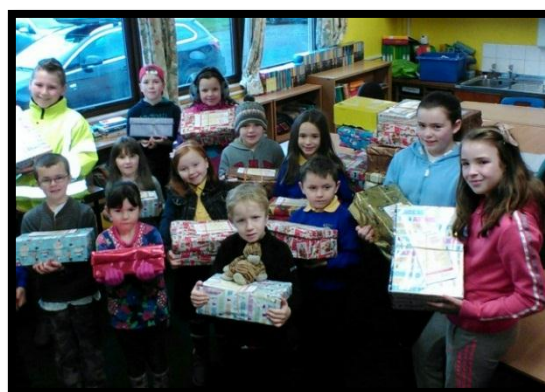
Staffin shoeboxes set for Romania.