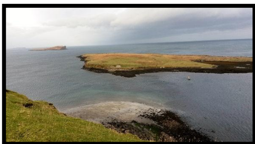
An autumnal Stenscholl Island.