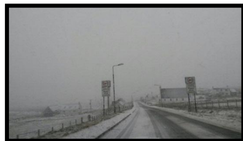
Staffin winter whiteout conditions.

The community council would be delighted to hear from any local people who would like to be included on a volunteer list, if an emergency situation arose.