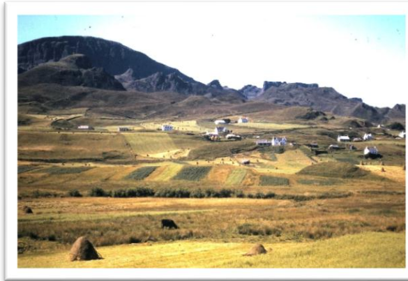
GOLDEN STAFFIN: Haymaking in Stenscholl.